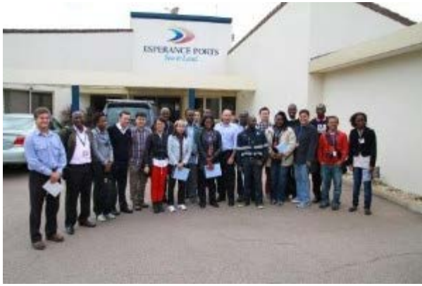
Photo: Participants from a previous Regional Development program held in Perth. The photo captures the group on a field trip to the Esperance Ports.