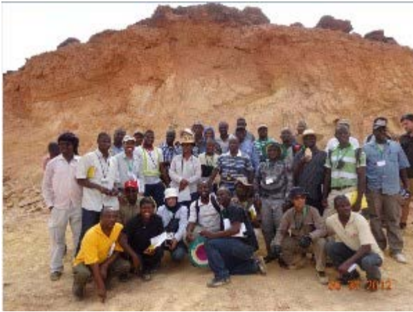
Photo: Participants from a previous GIS program held in Ghana.