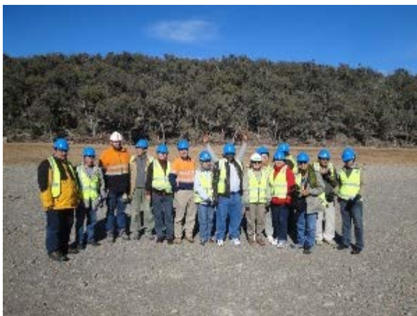
Photo: Participants from a previous Large Volume Waste program held in Brisbane. The photo captures the group on a field trip to NSW.