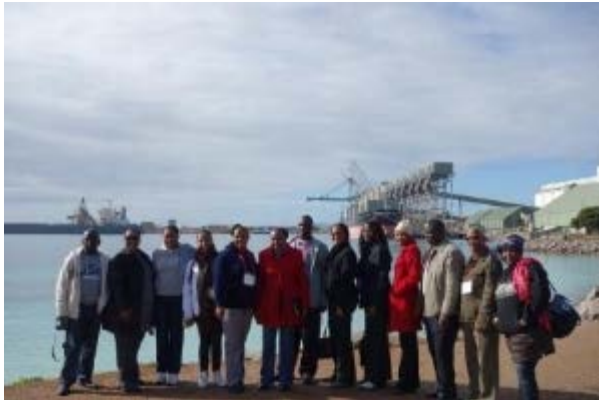
Photo: Mining and Agriculture study tour course participants at the Port of Esperance.