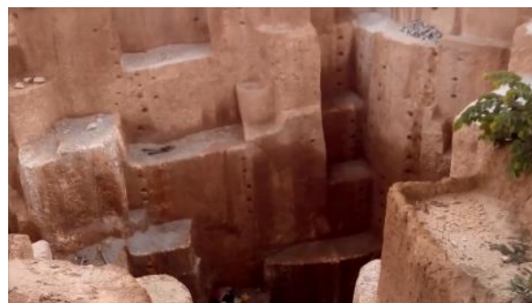
Tourmaline mine in Kaduna State.